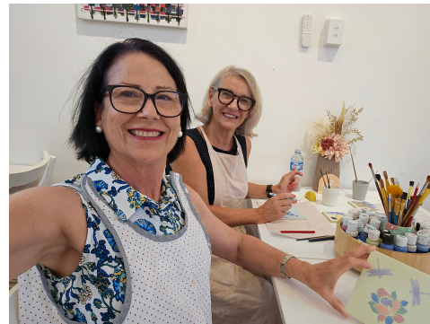
Fun & Creativity at the Painted Teapot